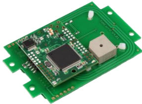
TWN4 OEM PCB Bottom View