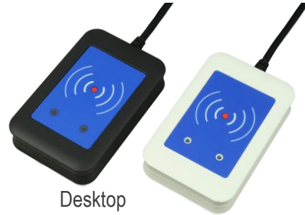
Desktop Top View

Elatec's TWN4 Family allows users to read and write to almost any 125kHz/134.2kHz and 13.56MHz tags and/or labels. It supports all major transponders from various suppliers like ATMEL, EM, ST, NXP, TI, HID, LEGIC, INSIDE etc. and ISO standards like ISO14443A/B including layer 4 (T=CL), ISO15693, ISO18092 / ECMA-340 (NFC).